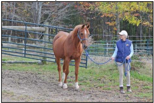
Approach is rarely linear. Horses move forward and back as they investigate. Bronzz circles

CURIOSITY is a powerful positive emotion that makes horses want to investigate. It's how their wild ancestors found food, water, and shelter. But no sane prey animal marches straight up to something suspicious, as people often expect horses to do. He wants to check it out first from a distance and ease in carefully. Many horses are anxious and spooky because they have learned to anticipate pressure to approach something too quickly. Instead, I wait with loose lead and relaxed body. I let Bronzz show me when he is ready to move forward, and when he needs to temporarily retreat.