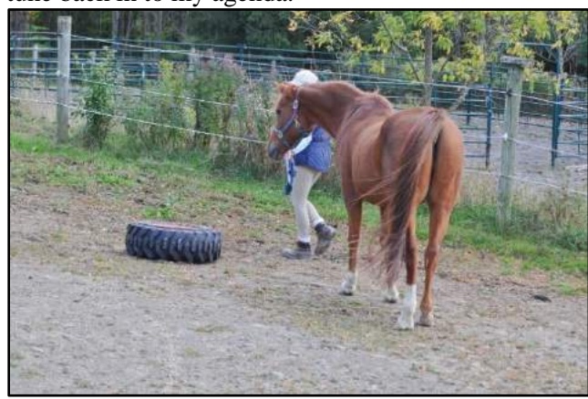
Time elapsed: 7 minutes.

Touch starts with the delicate whiskers on his muzzle. Bronzz's investigation uses 4 senses (sight, hearing, smell, and touch). Many horses would also taste the new thing, thus engaging all 5 senses in their discovery process. Now I have a calm horse ready to tune back in to my agenda.