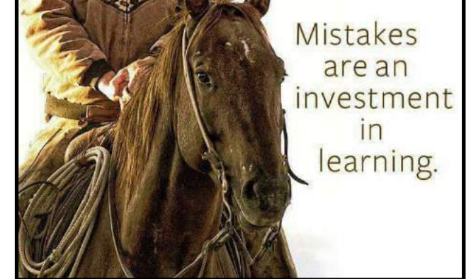
Where Are You Riding This Year? Check out:

NYSHC Equestrian Trails Guide For over 80 places you can go in NYS at